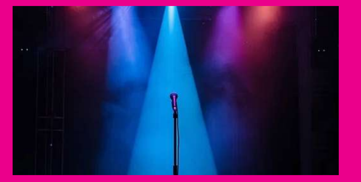
Our An Evening With series offers an exclusive, up-close experience with a GRAMMY nominated music artist—an intimate conversation and concert designed to uplift, inspire, and fill our hearts and ears with pure joy.