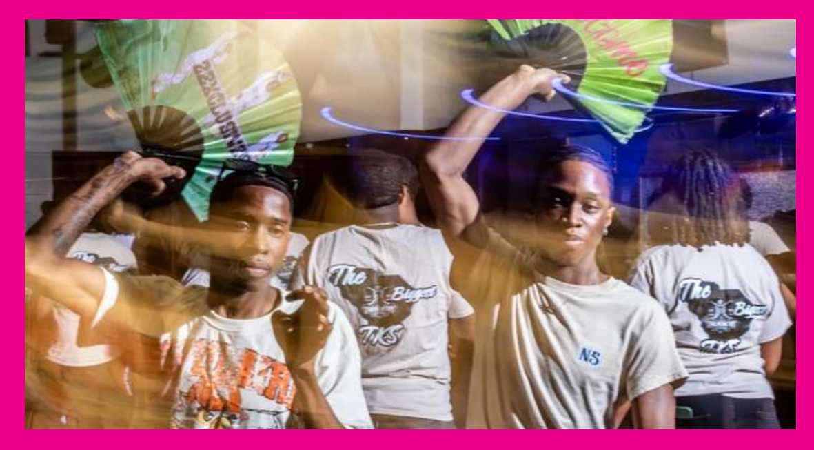
Other programming that including kids programming, dance, community events and experimental art.

Art Night Out transforms Friday evening into an exploration of the most electrifying galleries, groundbreaking exhibitions, vibrant murals, and unexpected artistic havens. Prepare to see the city's visual arts scene in an exciting new way.