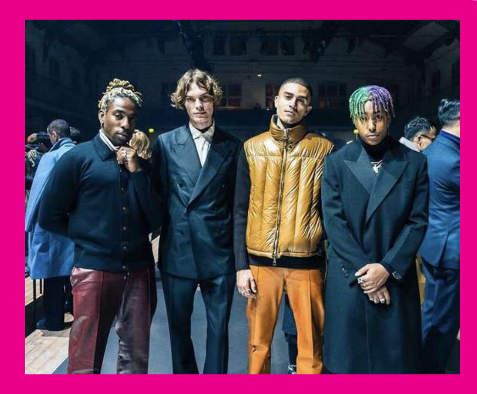
FOR THE FELLAS: A Brand new solo exhibition at Newark Arts' new gallery and gathering space located in Vermella Broad with a focus on Men who love the arts.

The Gold Ball - Inspired by last years Pink Ball, the Gold Ball will mark the opening of NAF2025 at Newark Museum of Art as we celebrate our communities golden state of creativity and resilience.